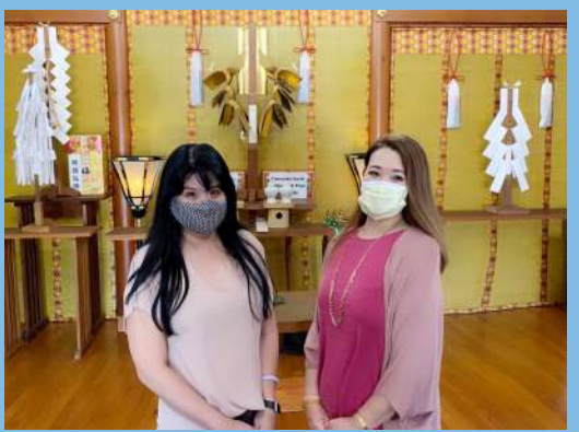
Private Blessings were performed for two sisters on August 22