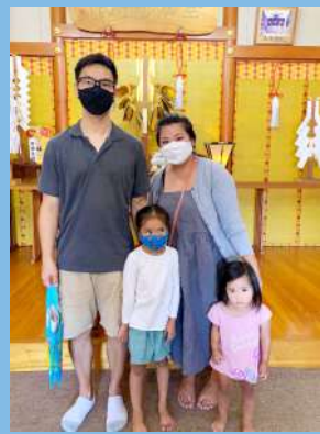
Happy Yakudoshi Birthday!

The 100th Anniversary Festival for Hawaii Kotohira Jinsha will be held on September 27.