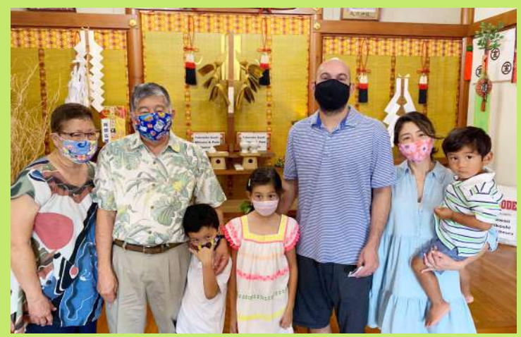
Family blessings affirm the ties that remind us of yesterday, provide strength and support today and give us hope for tomorrow