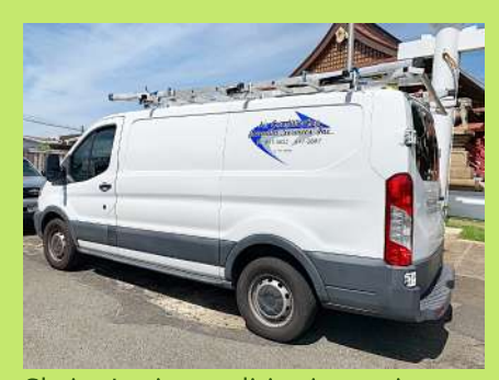
Shrine's air conditioning units were serviced on 10/14