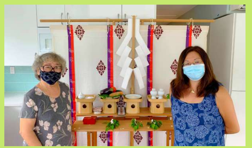
A House Blessing was performed for a Kaneohe home on October 4