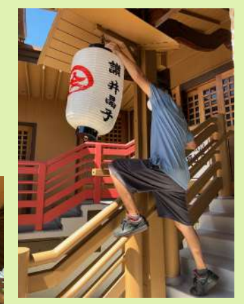
Mahalo Nui to Akiko Sanai for two exterior chochin lanterns to commemorate the 100th Anniversary of the shrine

The old deteriorated, interior chochin lamps were made by Miyoshi Shoten, a famous chochin maker in Kagawa-ken in 1987 to commemorate the building of the Kotohira shrine building extension 33 years ago.