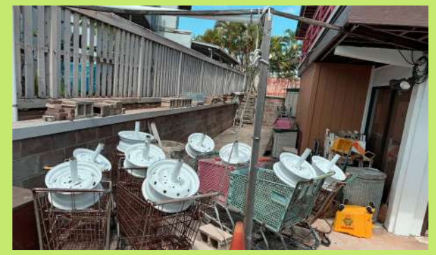
Old car rims were cleaned of rust, primed and painted - - to be made into stanchions for New Years day

The shrine's aluminum frames were warped and caused the screen joints to loosen. Birds also tore through the screen and built a nest on one of the sills.