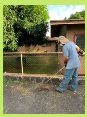
Cleanup and preparations for the 100th Anniversary festival was done on September 25 and 26.