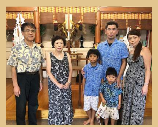
Shichigosan blessing for two brothers from Japan on October 19