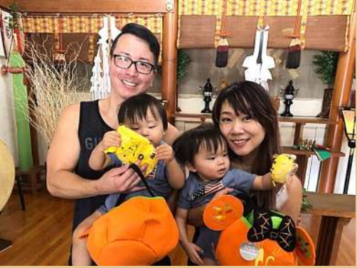
1 year-old blessing for adorable twins