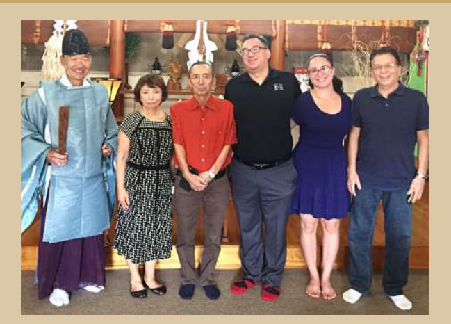
Ohana blessing performed on 9/16