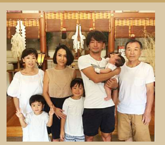
Baby Blessing on 9/17