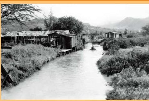
The original course of the Kapalama Canal was the Niuhelewai Stream, pictured here in 1937.

planned along both sides of the canal from the rail transit station at the corner of Kokea Street and Dillingham Boulevard to North School Street.