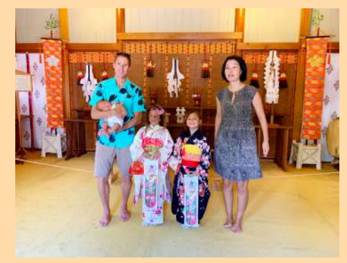
Shichigosan continues until November 22 however, we are fully booked for the 2020 season. Please keep us in mind for 2021