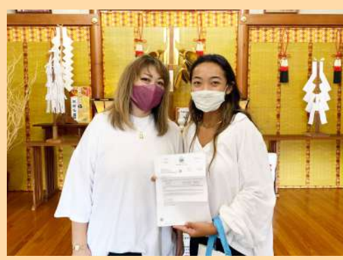
New business , new responsibilities, new visions - may you reap your rewards and reach your dreams! New business blessing performed on 11/12