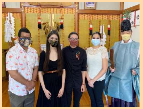
Best wishes on this wonderful journey, as you build your new lives together. Wedding on 10/31