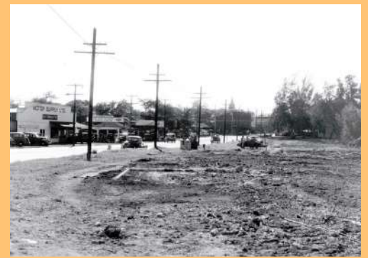
North King Street looking towards Waikiki. The white building on the left is where Palama Market now stands. The steeple of Kaumakapili Church can be seen in the background

Until the 1940s, the area along North King Street from Aala Park to Houghtailing was known as Palama Japan town.