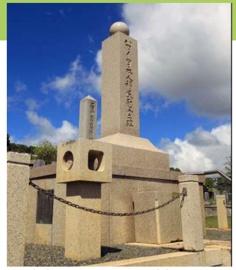
Yosebaka monument at Makiki cemetery

Japanese plantation workers known as gannen-mono -- the 148 Japanese