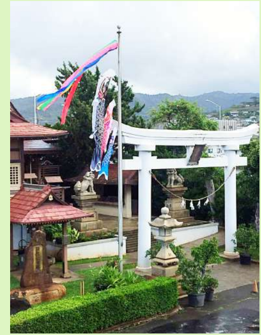
The shrine displayed its Koi Nobori on 4/20 in celebration of Tango no Sekku or Boy's Day.

The wooden frame suffered from decay and wood rot.