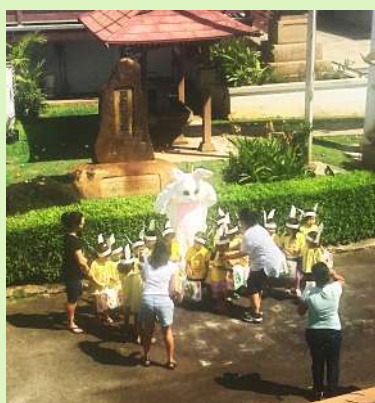
Love A Keiki Learning Center held their annual Egg Hunt at the shrine on Good Friday, April 14.