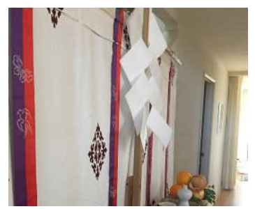
House blessing at a home in Liliha on 3/31

Many people are beginning to realize the value of ancient wisdom as our lives become deeply enriched by adapting the traditions of the past and blending it with our own spiritual realities.