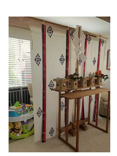
House blessing at a home in Hawaii Kai on 4/6

The le-barai or House Blessing is a traditional Japanese purification rite meant to cleanse all negative energies form our environment and replacing it with a positive and uplifting energy to bring balance and harmony to the occupants of the home.