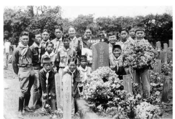
Japanese American Boy Scouts cleaning Moiliili cemetery and placing flowers at each grave on May 30, 1932

Priests and members of Hawaii Kotohira Jinsha-Hawaii Dazaifu Tenmangu, Izumo Taishakyo Mission of HI and Daijingu Temple of HI will participate in the offering of prayers and flowers at Punchbowl, Makiki and Moiliili Cemeteries.