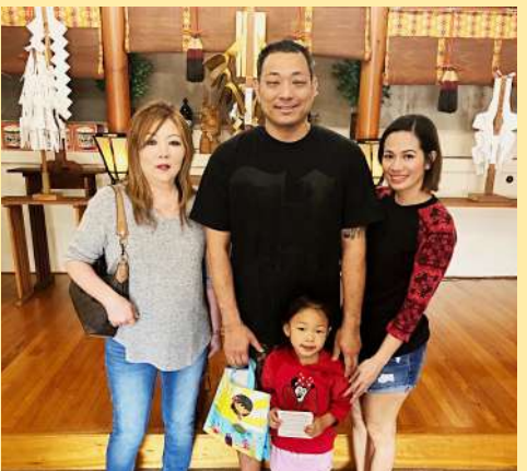
Yakudoshi blessing performed on February 25