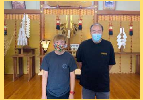
Getting a new job is always a moment of great significance. Wishing you all the best for your career ahead !!!