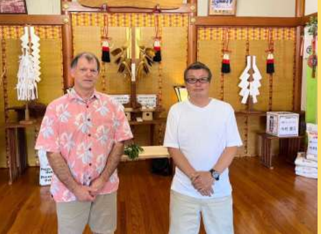
Private blessing to express gratitude for the safe completion of a home construction.