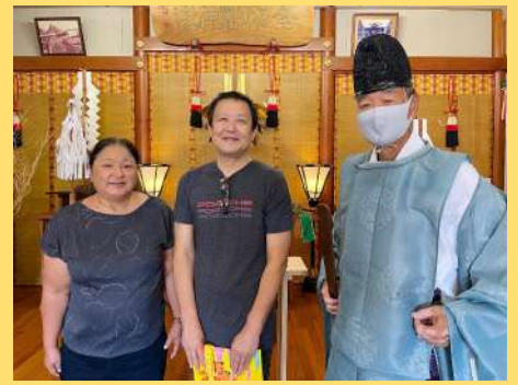
A belated Kanreki blessing was performed for a shrine friend