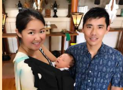
Congratulations on your new bundle of joy! May your world be filled with love