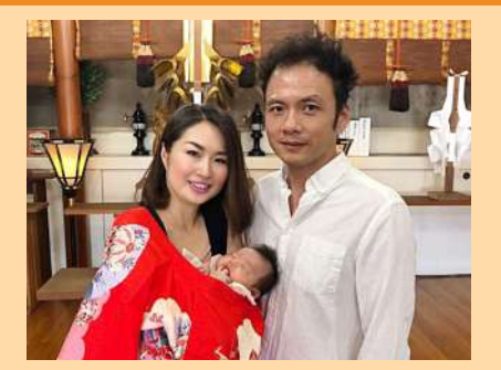
So many happy and wonder filled times ahead for the two of you...Congratulations!