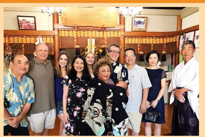
Baby Blessings are meant to express appreciation for the miracle of a new life and for protection of the child