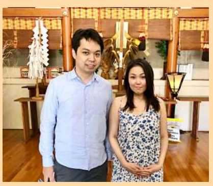
Safe Birth Blessing cultivates positive energies for a safe birth experience and helps the mother-to-be feel empowered for her new role in life as a mother