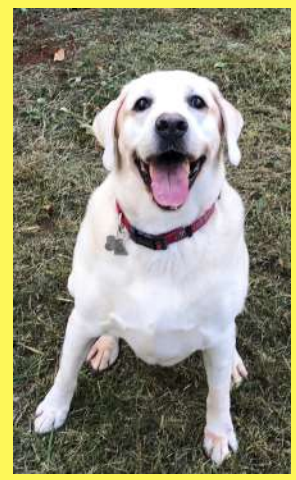
A long distance blessing was performed for Bo on June 29