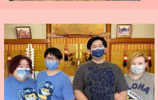
Kanai Anzen Family Blessing

You've stepped into a bold new world ....Congratulations on your new business and best wishes for never-ending success!