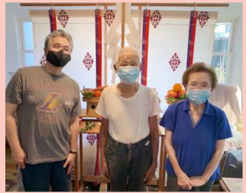
House Blessings were performed for a home in Mililani and a home in Kapahulu

Refer to the website's Yakudoshi page for more information.