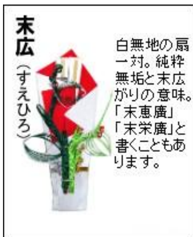
Suehiro - or fan is a symbol of happiness, as it expands, symbolizing a bigger and better future.