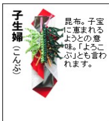
Konbu - Seaweed is included to symbolize happiness and fertility.