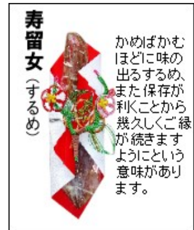
Surume - Dried cuttlefish symbolizes a long relationship