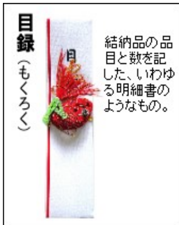
Mokuroku - List of all gifts