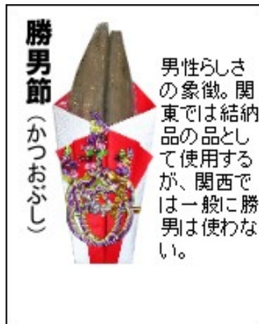
Katsuo-bushi symbolizes masculinity and is used only in Tokyo or the Kanto area.