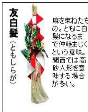
Tomo-shiraga - or hemp symbolizes white hair, expressing wishes for a long life together.