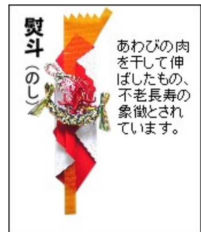
Noshi - Long strips prepared from dried abalone symbolizes longevity.