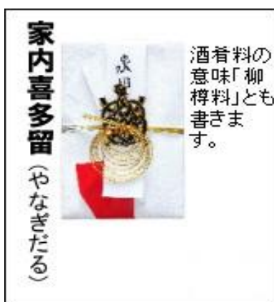
Yanagi-daru - Money to purchase sake casks made from the willow tree, which symbolizes obedience by the new bride.