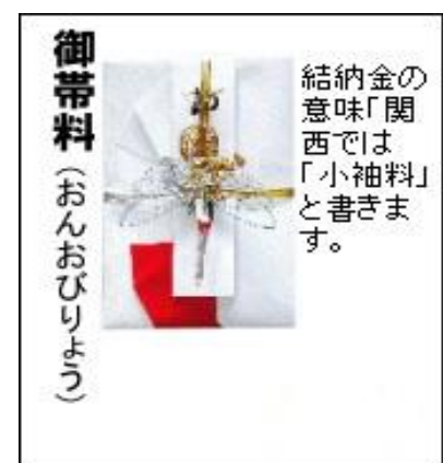
On-obiryo - Literally, “money to buy an obi sash,” is a dowry exchanged as part of the Yui-no gifts.