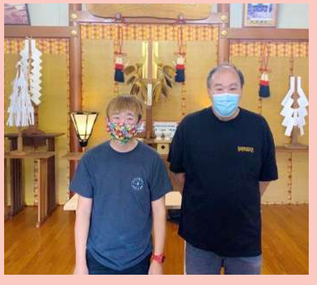
The first private blessing for 2024. May you be blessed in every phase of your life.