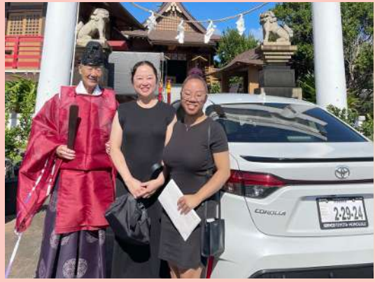
A Car Blessing was performed on 12/26. Someone was on Santa's "Nice List."