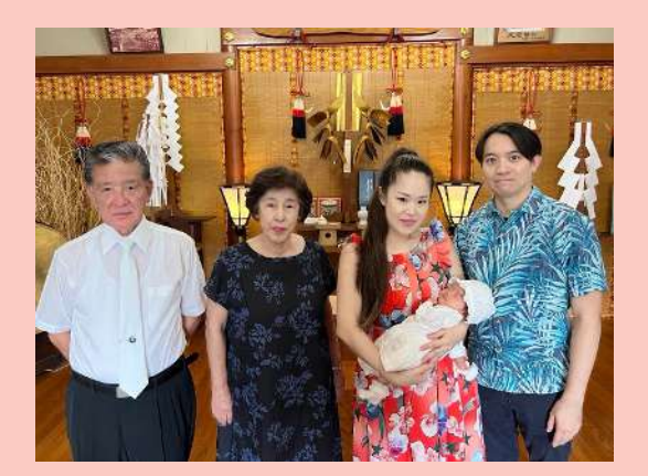
A Baby Blessing was performed on 12/28 for a darling little girl. Congratulations on the arrival of your precious little one!