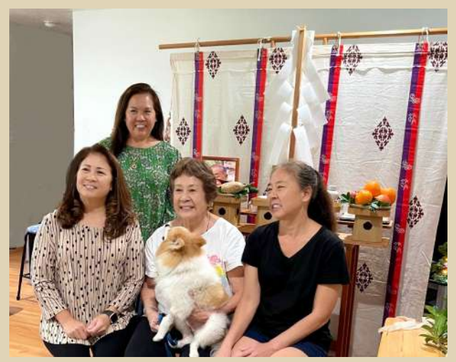
A remembrance Ceremony was held for a family that lost its patriarch 10 years ago