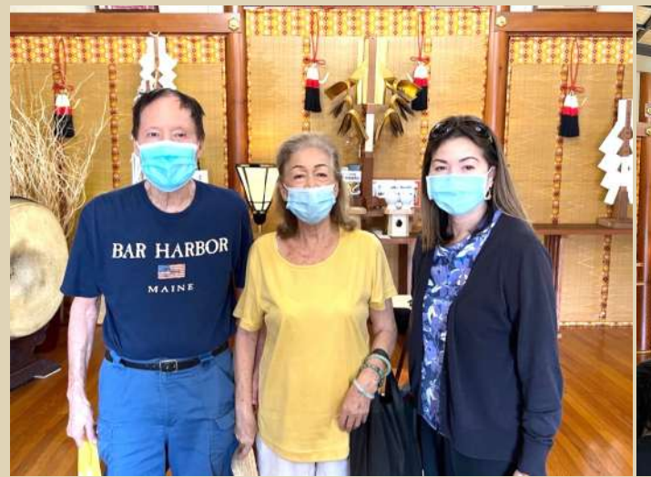
A Car Blessing was performed for shrine friends on 12/1