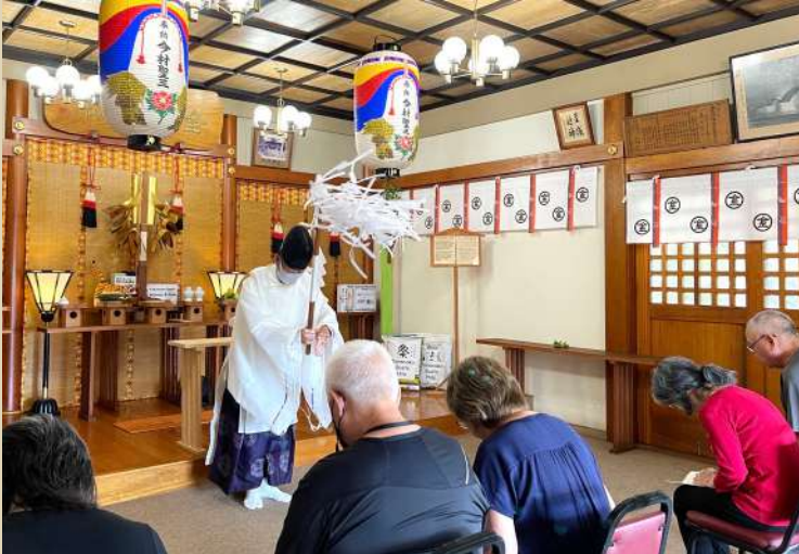
The last Tsukinamisai of 2022 was conducted in the presence of our Officers and Directors. We look forward to 2023 with fervent wishes for a return to normalcy.