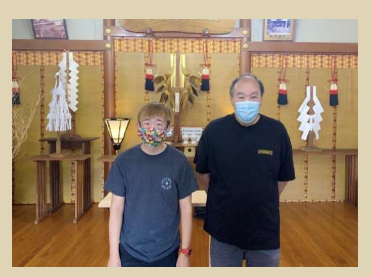
A private blessing was conducted to help one realize their goals