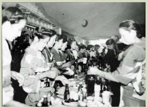
Geishas from local Tea Houses serving food and drinks

In early 1942, the building was converted to a USO facility named the Victory Club by the Federal Government and remained open until 1945. The building was returned to International Enterprises in 1948.