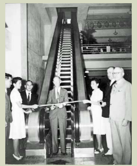
The escalator was imported from Tokyo and installed by the Von Hamm Young Company

modeled after the Mitsukoshi Department store in Tokyo and had an escalator between the first and second floors. Many shoppers are said to have visited the store just to ride on the first escalator in the Islands.