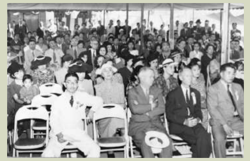
Opening ceremony of the House of Mitsukoshi on December 21, 1940

The House of Mitsukoshi ceased operations in December 1941, less than a year from its opening.