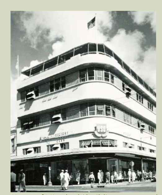
House of Mitsukoshi building converted to the USO Victory Club

In early 1942, the building was converted to a USO facility named the Victory Club by the Federal Government and remained open until 1945. The building was returned to International Enterprises in 1948.